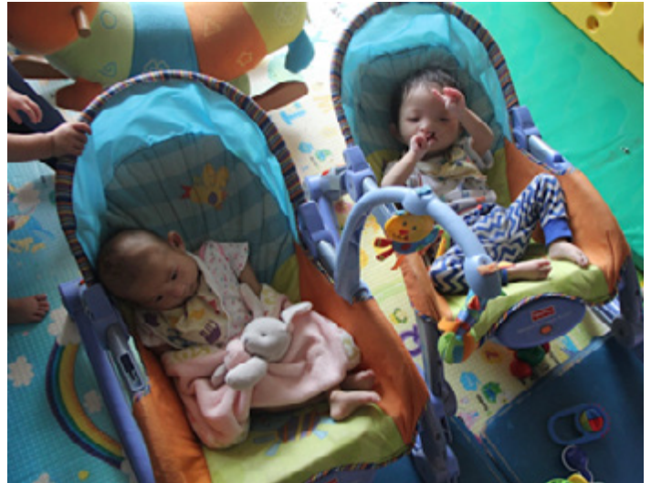
Two babies at Peace House with physical and mental challenges