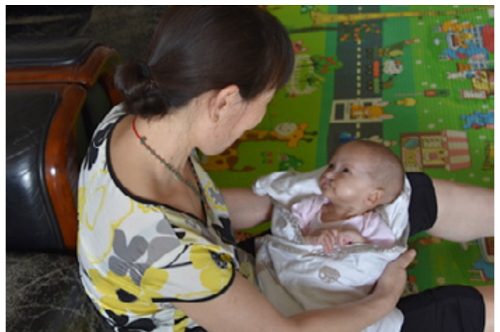
Wonderful nanny with sweet baby