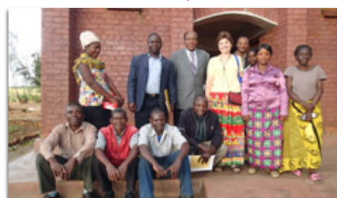
PGH International Partnership: Malawi