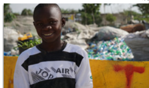
Work (formerly Team Tassy), Haiti