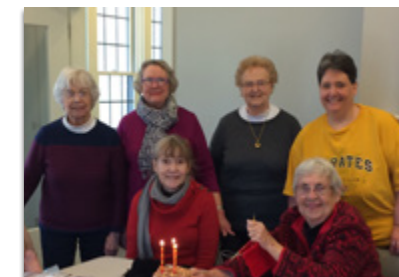
Knitting for Mission