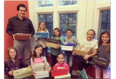
Instagram post from November 2, 2017