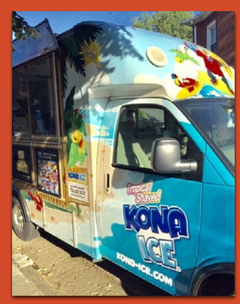
A fun treat for everyone who came to The Ladle's Summer Picnic -- Kona Ice!