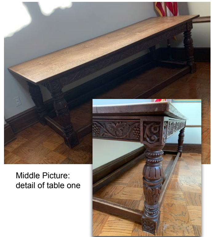
Middle Picture: detail of table one

The second table is located in the old Session room which is now a part of the Childcare rooms on the first floor.