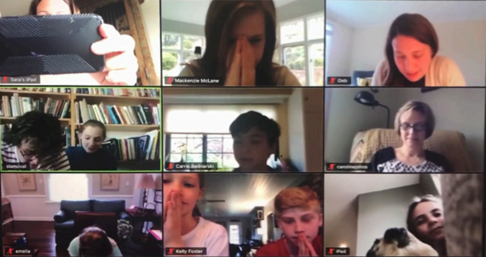
Praying during our weekly Sunday School class.