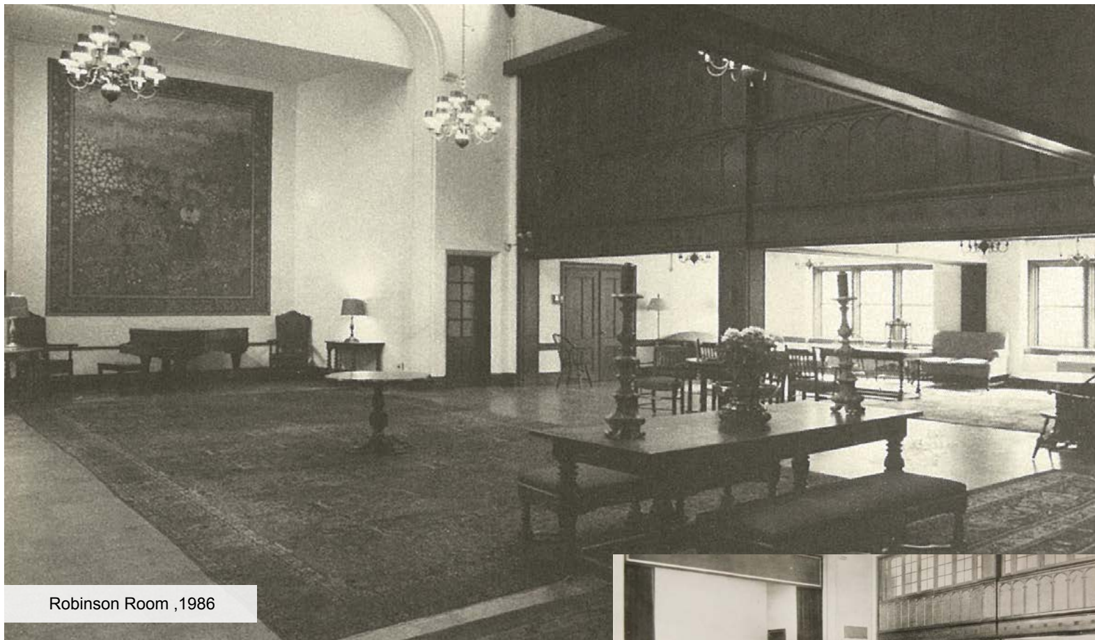
Robinson Room ,1986