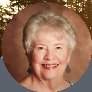
RETREAT SPEAKER & LEADER