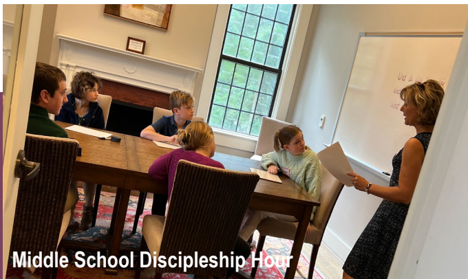
Middle School Discipleship Hour

This fall we're excited for all kinds of things coming up. Below are a couple of events to make sure you have on your calendars! I hope to see everyone.