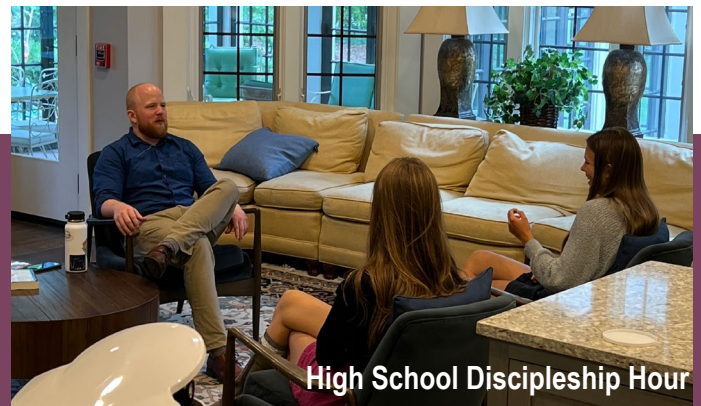
High School Discipleship Hour