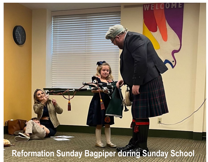
Reformation Sunday Bagpiper during Sunday School

If you are willing to help in Children's Worship, we are in need of one extra volunteer each week to participate. Please feel free to stop by to chat after church or reach out to my email at hmellor@sewickleypresby.org if you can or are willing help once a month or even every other month so that we can have two adults in Children's Worship every week. Thank you!