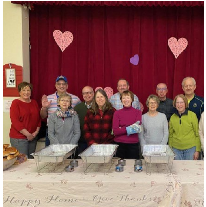
Serving dinner at The Ladle in February, 2023

You can learn more about the history of each organization in relation to our church AND find out how to volunteer on our website. Please visit sewickleypresby.org to learn more about these great missions.