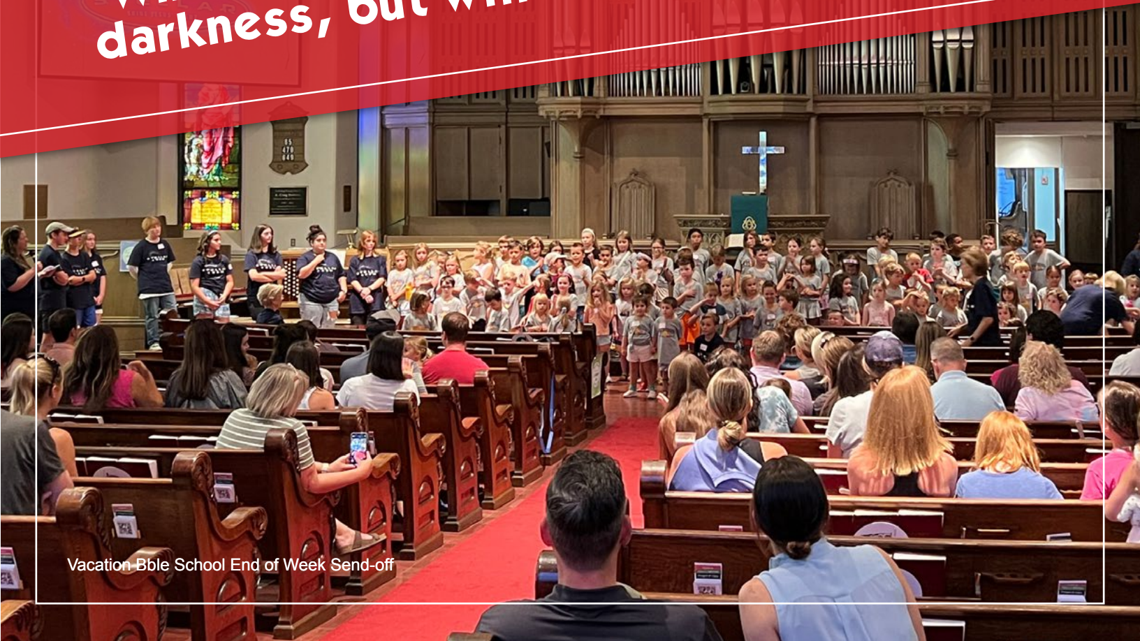
Vacation Bible School End of Week Send-off