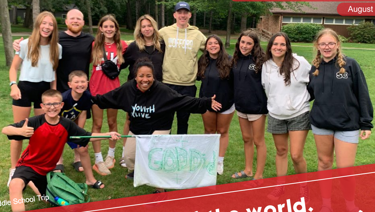
Surf City Middle School Trip

I am the light of the world. Whoever follows me will never walk in darkness, but will have the light of life.