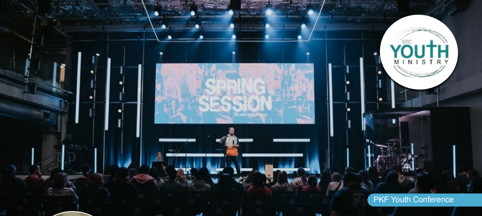
PKF Youth Conference