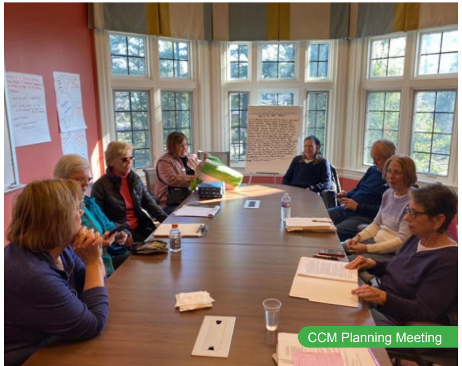
CCM Planning Meeting