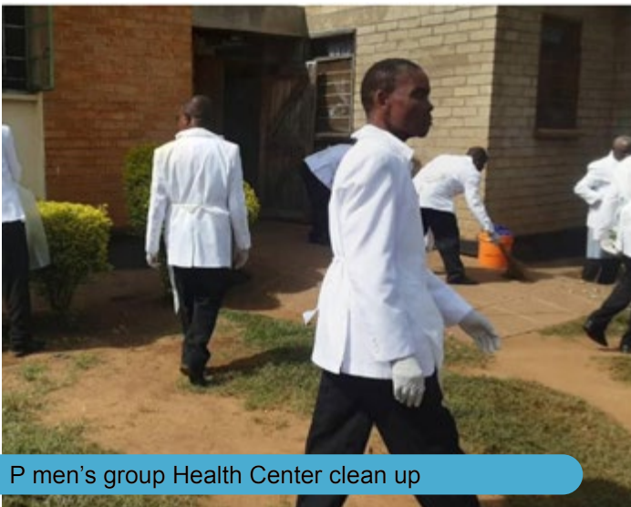
P men's group Health Center clean up