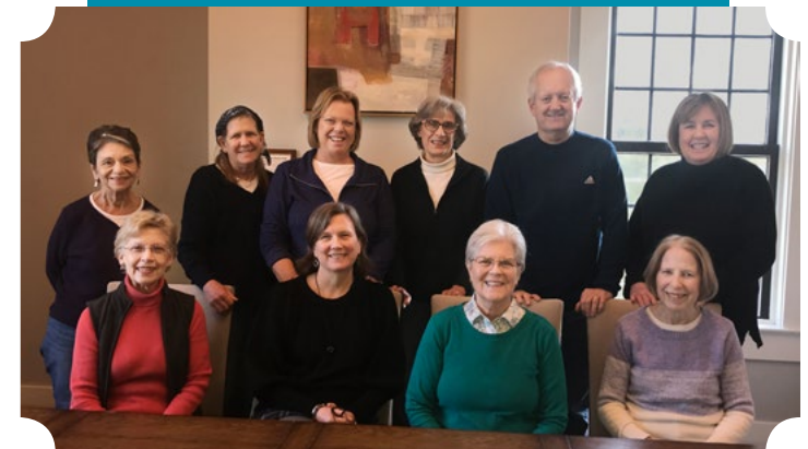
Pictured above: CCM Members