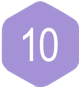
MEMBERS WHO ENTERED THE CHURCH TRIUMPHANT (LISTED ON PAGE 13)